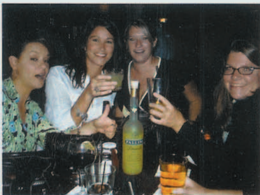
Partygoers enjoy Pallini Limoncello from Castle Brands.