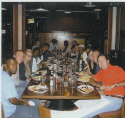
A dinner and fundraiser for Hurricane Katrina survivors was hosted by The Public House.