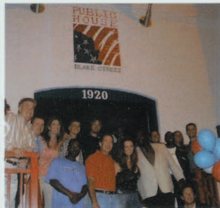
Organizers and hurricane survivors gather for a photo in front of The Public House.