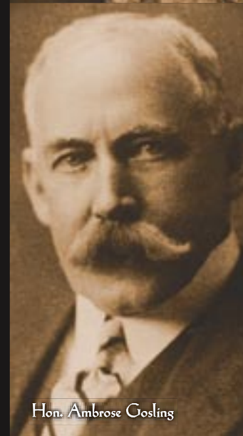
Hon. Ambrose Gosling